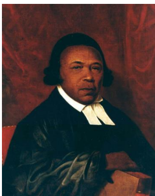
Absalom Jones by Raphaëlle Peale (1810)